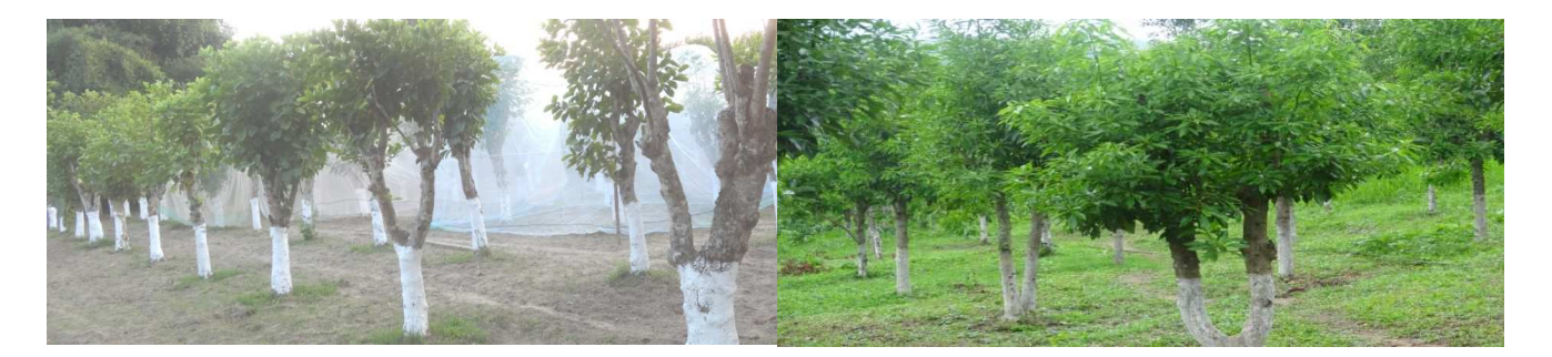
Pruned muga host plant