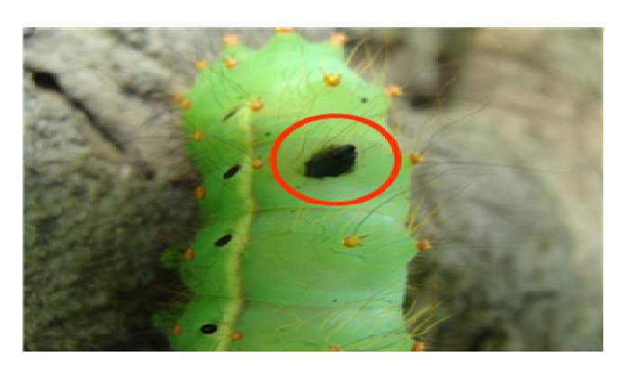
Uzi infested lartvae