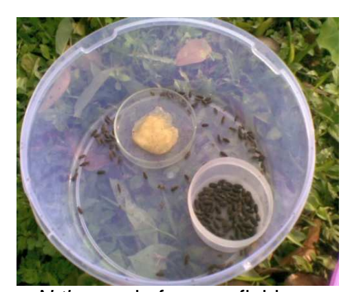
N.thymus in farmers field