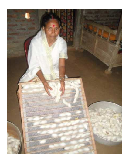
Front view of mountage