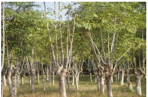
Leaf proliferation after pollarding