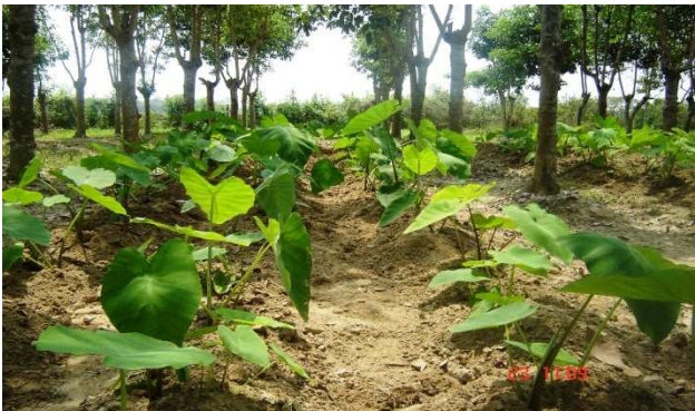
Intercropping with Ginger