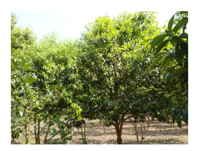
S-3 Morphotype of som