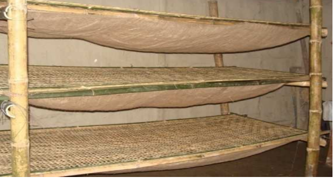
Rearing on platform